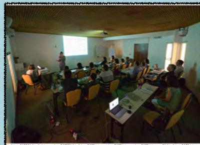
THE CLASS AT WORK